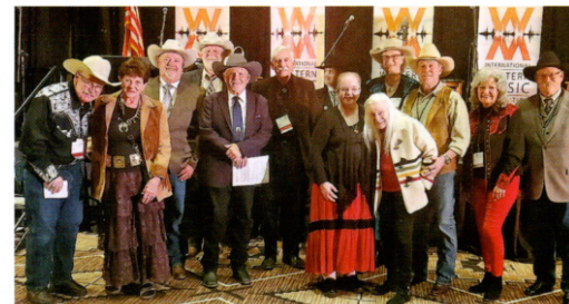
Chapter members enjoy a great time in Albuquerque.